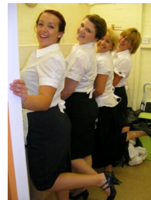
The Tiller Girls